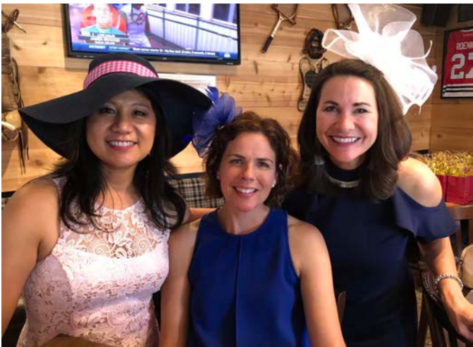
On May 5, RVN hosted its annual "Talk Derby to Me" Charity Pub Crawl, where the finest derby-viewing wear was on display. Roscoe Village Pub, the Village Tap, Commonwealth Tavern, and the Four Treys Tavern each hosted the party, with proceeds to the Common Pantry.