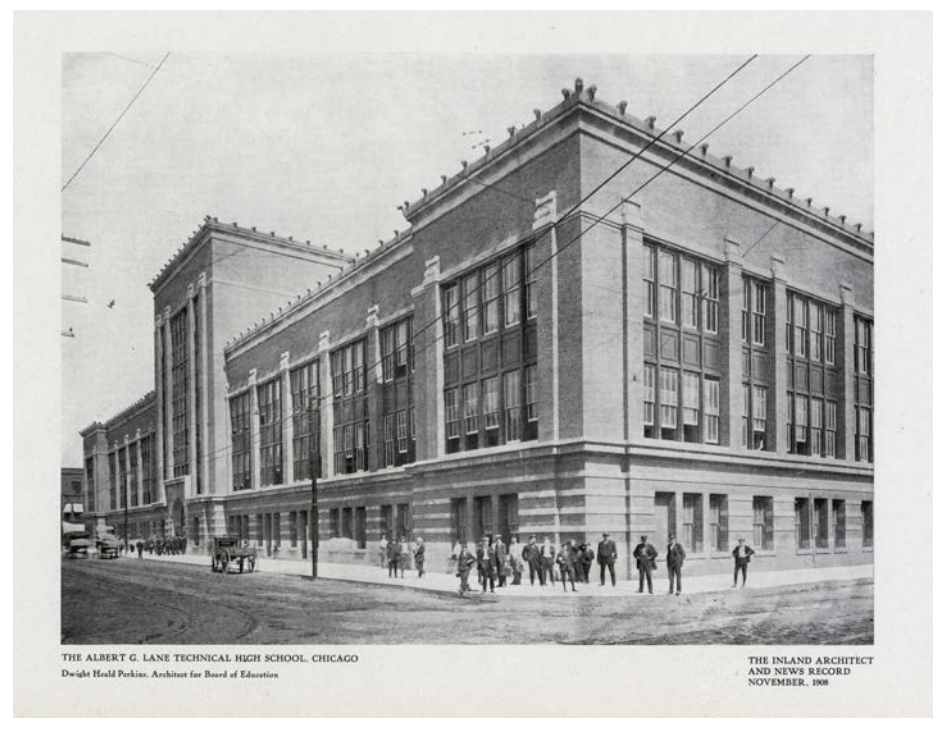
The original Lane Tech, Division & Sedgwick.

Today, Lane is thriving, diverse, and adds over 4,000 temporary residents to Roscoe Village each day in the form of students, faculty, and staff. Tim Cook and Apple, it seems, picked a winner.