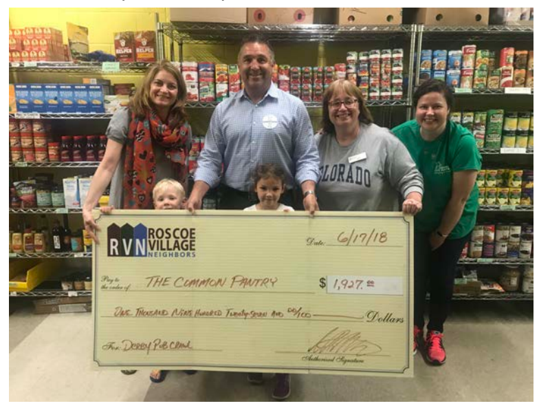
RVN presents a donation to Common Pantry, June 17, 2018.

RVN events aren't just about having a good time; they also support vulnerable parts of our community. On May 5, Roscoe Village Neighbors headed up a Charity Pub Crawl, returning once again to the popular theme "Talk Derby to Me." Attendees wore their Kentucky Derby finest, sang karaoke, enjoyed drink specials, and cheered on the horses. But at the same time, they were also being charitable.