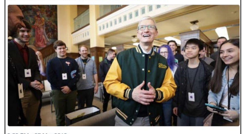
3:53 PM - 27 Mar 2018

Thanks to the students and faculty of Lane Tech for being our gracious hosts. Rich with history and forward-thinking — we couldn't ask for a better place to talk about the future of education. @ChiPubSchools